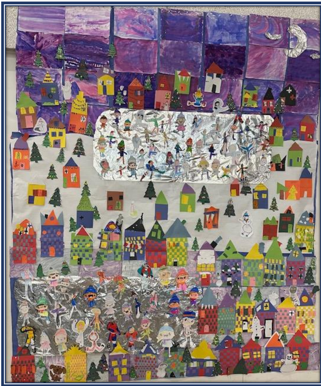
Skwo:wech Winter Village By: The Wolf Pack (Divisions 9, 11, 12, 13 & 17)