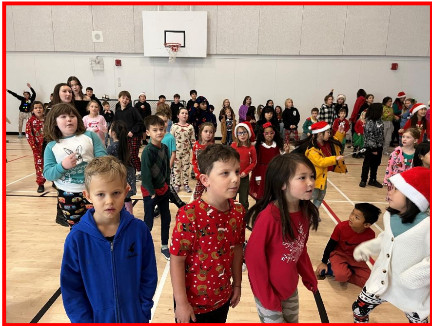
Celebrating Red and Green Day!